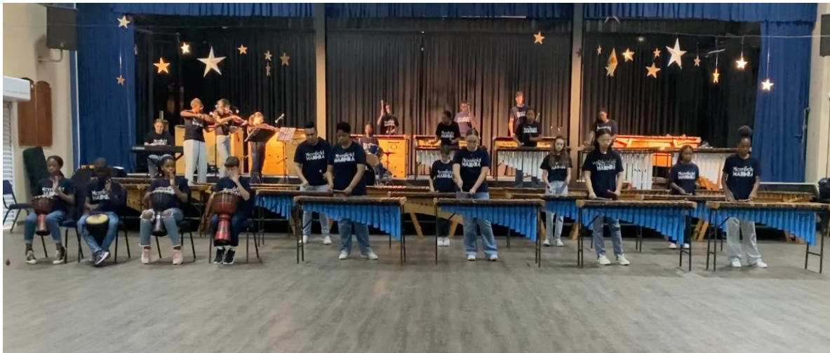
Merrifield College from Gauteng. South Africa