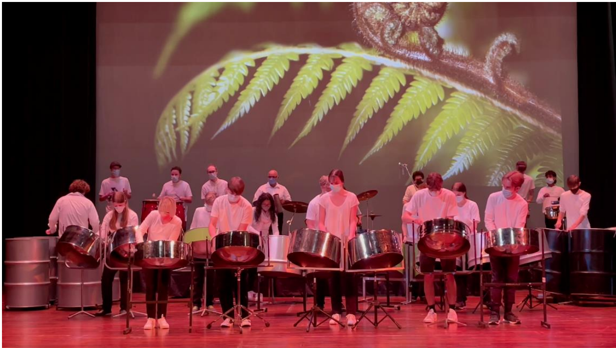
Aotearoa Steel Orchestra from Auckland New Zealand