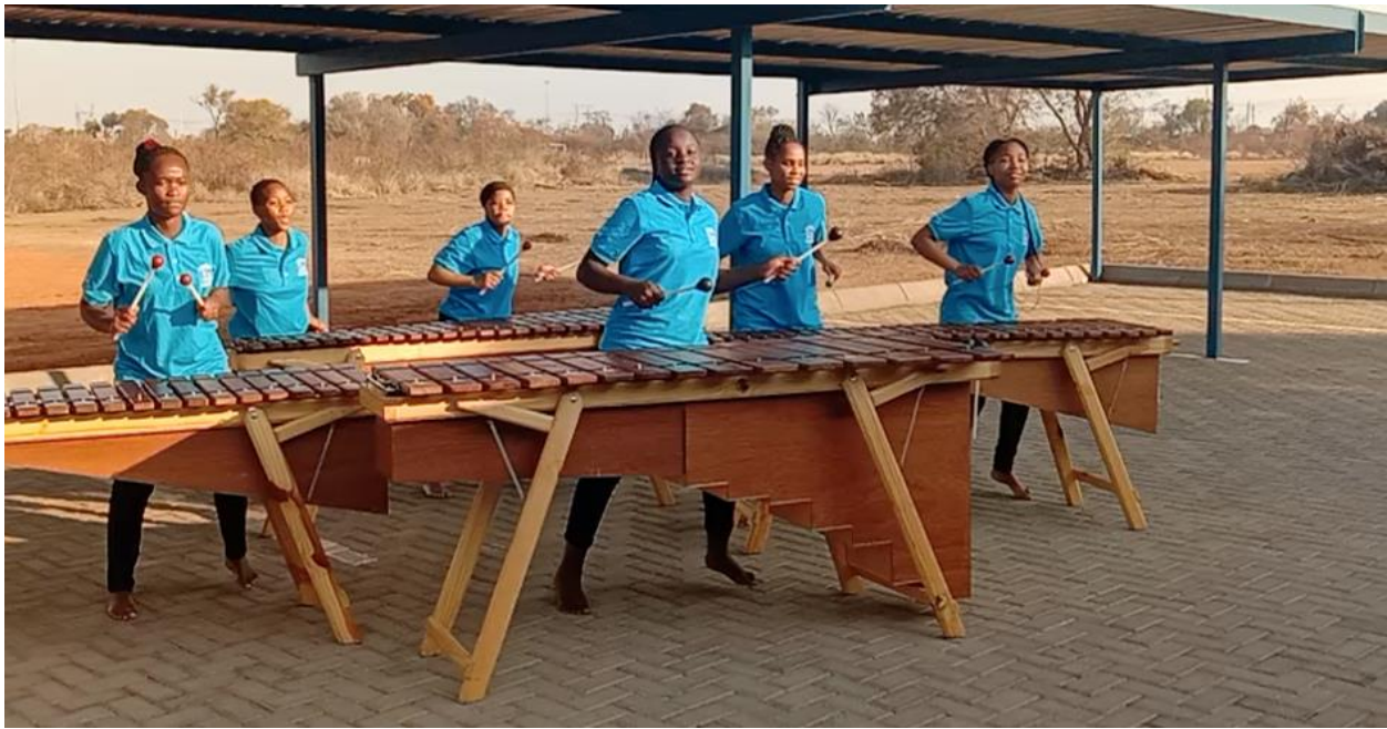
Dominican School for Deaf Children from Gauteng, South Africa