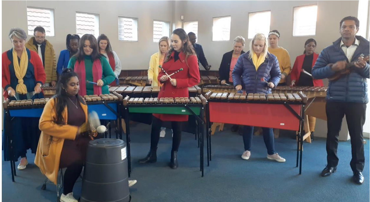
Maranatha Teachers' Band from Mpumalanga, South Africa

Thank you to all the teachers from all around the world who embraced this Festival with love and dedication. We appreciate all the hard work you have put into this Festival. We will continue to host a Virtual Festival every year so that all our friends around the world will continue to take part in our Festival. Who knows, perhaps some of our overseas participants may come to South Africa to take part in our Live Festival in the future?