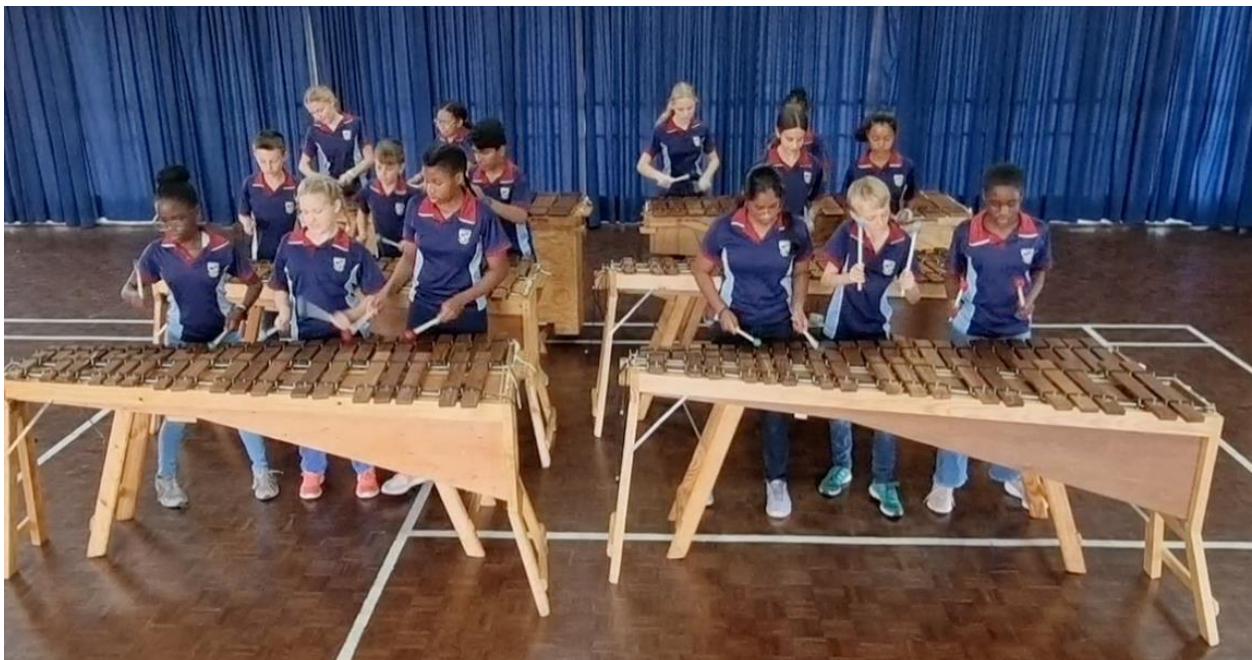
Westville Senior Primary School Marimba Band from KwaZulu-Natal, South Africa

Being a Virtual Festival, all participating bands took videos of their performances in various categories and age sections and submitted them by the closing date. We received 245 videos. These all had to be checked and put into the 21 band categories and 2 solo categories. Once checked they were uploaded onto a virtual platform for the adjudicators to view and adjudicate. When the adjudication was completed, the compilation and production of the actual Virtual Festival started.