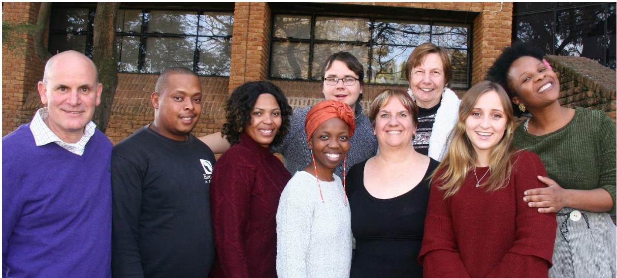
EDUCATION AFRICA FESTIVAL COMMITTEE

Education Africa in partnership with St Dominic's Catholic School for Girls, Boksburg was the host of this prestigious event.